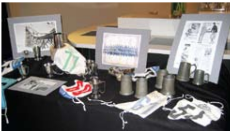
Some of Bill Day's donated Olympic memorabilia on display at Snow Gums Restaurant.