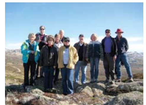
Members of the Perisher Historical Society on the side of Mt. Stillwell.