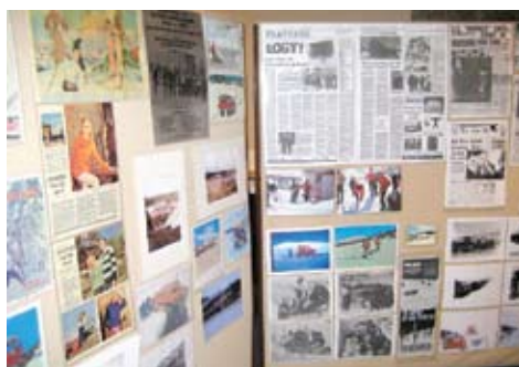
Images of an earlier period in the history of the Perisher Range Resorts.